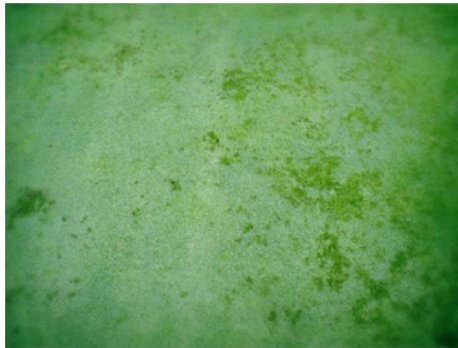
Before: Moss infestation on bentgrass putting green