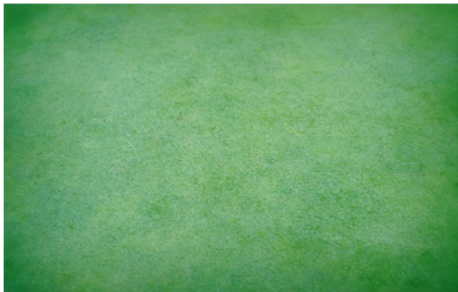
After: QuickSilver combined with sound agronomics provide an acceptable putting surface